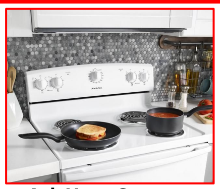
Ask Your Customer:

How often do you cook multiple dishes at once on your cooktop?