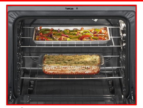
Ask Your Customer:

How often do you use multiple baking trays or casserole dishes?